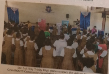
Sir by! Holy Trinity High students teach the visitors from GrassROOTS Community Foundation some dance moves at Invest in Girls