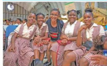
Say Cheese! Author, Activist and Founder of #1000BlackGirlBooks, Marley Dias smiles for the camera as she interacts with students at the Invest In Girls Summit held at St. James High in partnership with HerFlow Foundation on April 15, 2019.